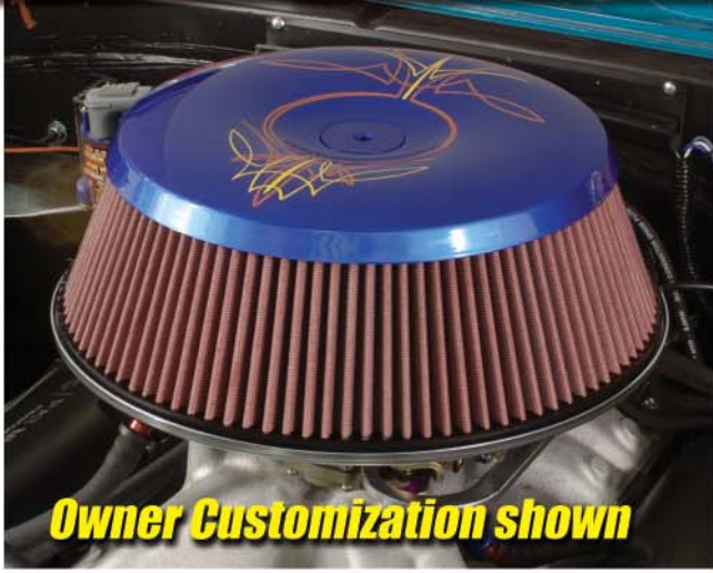
Owner Customization shown