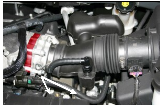
6. Reinstall the intake tube, tighten the two hose clamps, and reconnect the crankcase breather tube. Reinstall the beauty cover, and oil cap in the reverse order that they were removed. Re-connect the negative battery cable!