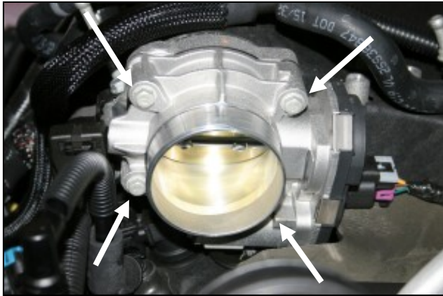
3. Remove the four bolts that secure the throttlebody to the intake manifold.