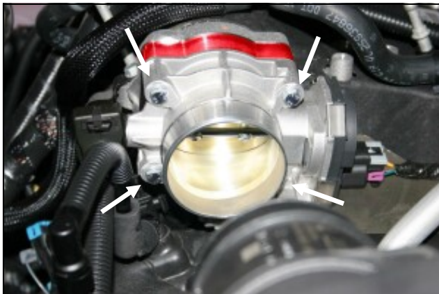
5. Install the provided bolts and washers thru the throttlebody and Poweraid Spacer and tighten to the manufacturer's specifications.